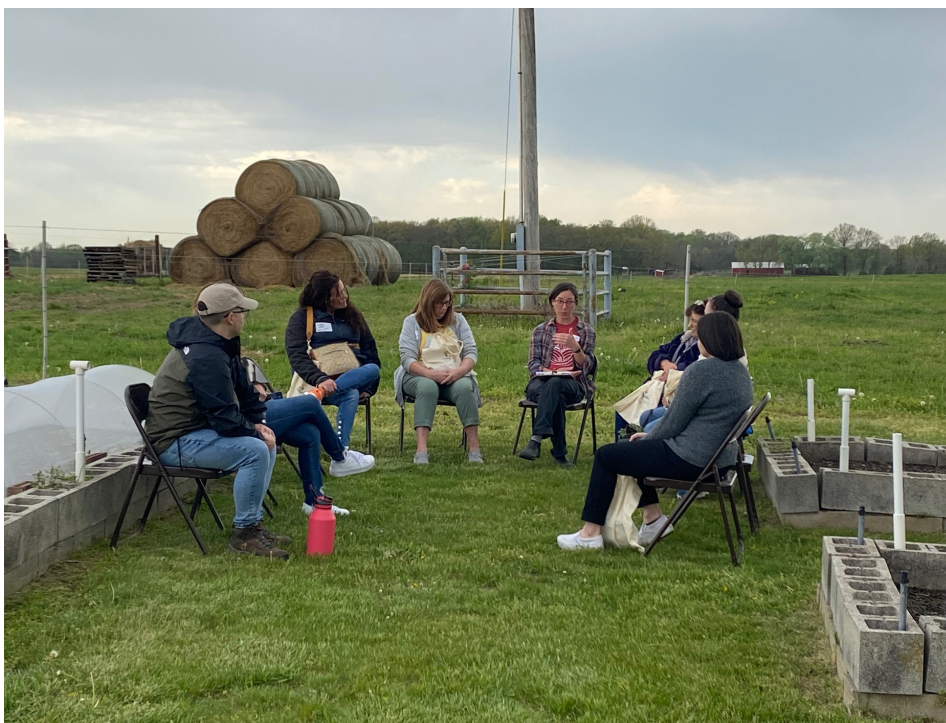
Community gardens open up new food streams in under-resourced communities.