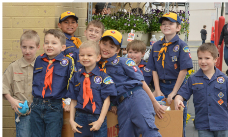
Local Scouts provided more than 1,500 meals.

Thank you to everyone who donated to this year's Scouting for Food drive. Boy Scouts of America Ozarks Trail Council held the 34th annual food and fund drive, collecting 974 pounds of food and $580 to provide more than 1,500 meals to our neighbors in need!