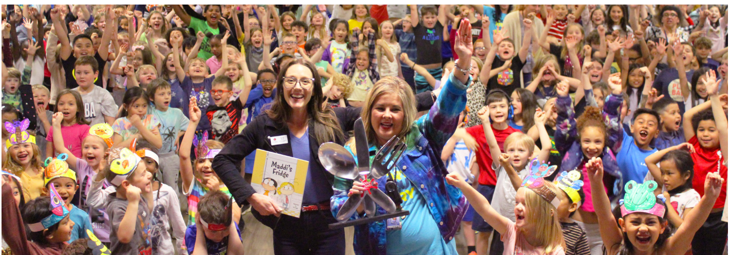
Winning school celebrates record-breaking Food Fight competition benefitting Ozarks Food Harvest.