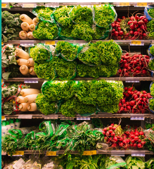
Farm Bill decision will impact hunger-relief efforts.