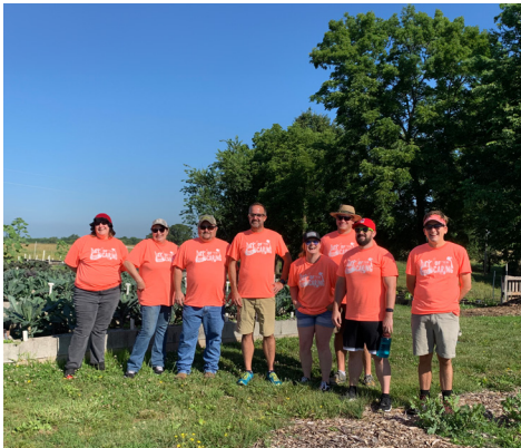
John Deere employees also volunteered at our gardens.

Huge thanks to the John Deere Foundation for their generous gift of nearly $29,000 to assist with food distribution across southwest Missouri! This gift comes at a critical time as food donations are down and the demand for food assistance has surpassed pandemic-level highs. The John Deere Foundation is directing its work to help end hunger for families and youth who live, work and learn in the communities they call home. Since 2016, The Foundation has provided over 500,000 meals for our southwest Missouri neighbors.