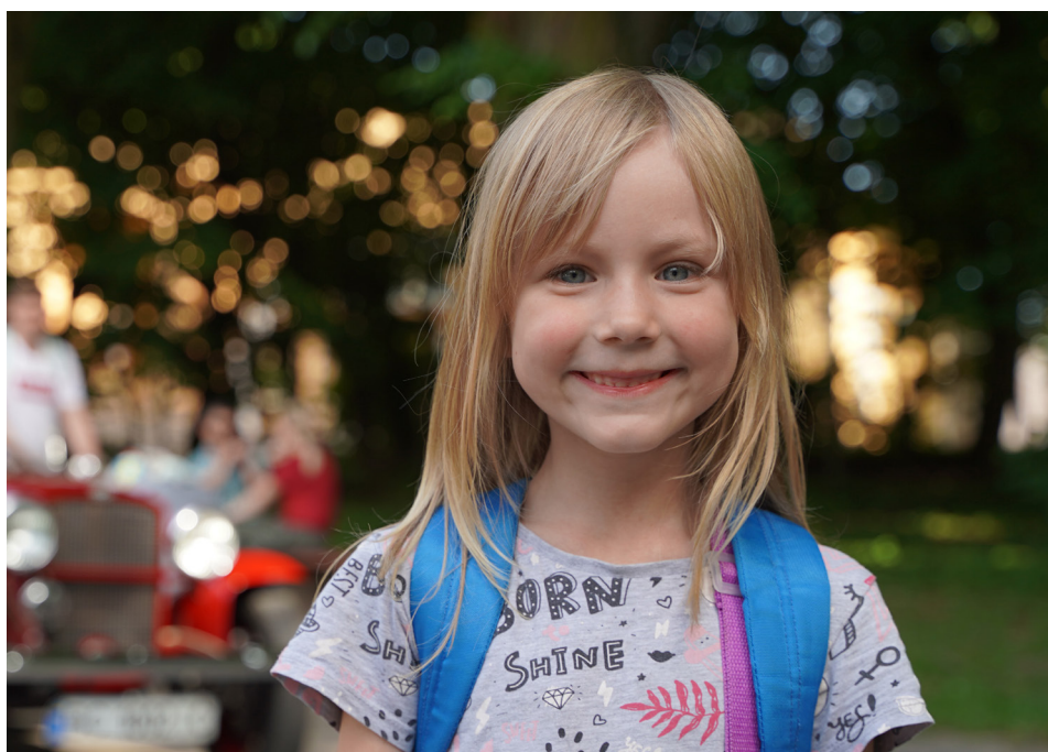
Weekends can be hard for children facing hunger.

A donation of $360, or $30 per month, will help provide weekend meals for one child for an entire school year. Your contribution will help ensure kids have easy access to nutritious, child-friendly meals each and every weekend. To learn more, visit ozarksfoodharvest.org/hungerthon .