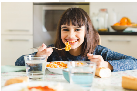
We are grateful for dedicated partners like Kraft Heinz.

We are so grateful to the Kraft Heinz Company Foundation, in collaboration with Feeding America, for its donation of $25,000 to The Food Bank. Kraft Heinz's donation will support our Weekend Backpack Program that helps provide thousands of meals to children experiencing hunger over the weekend. Support from generous partners means so much to the 1 in 7 children facing hunger in southwest Missouri.