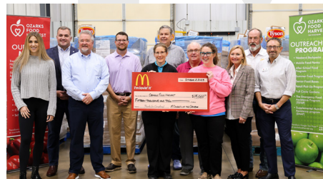
Tyson and McDonald's presented their generous donation at The Food Bank.

Tyson Foods, in partnership with McDonald's, donated more than 40,000 pounds of chicken breast fillet fritters last month. Tyson made their donation in honor of McDonald's $15,000 donation to our Hungerthon event in September. Neighbors facing hunger often forego buying meat when times are tough because of its higher price and may miss important nutrients in their diet as a result. This donation of chicken will provide 33,000 meals and help our neighbors facing hunger get the protein they need to thrive.