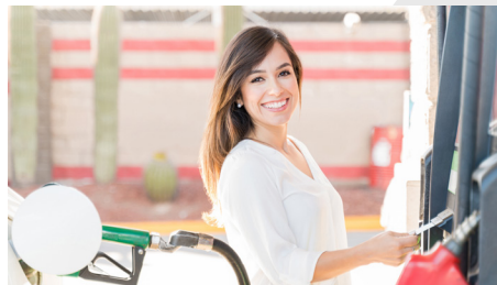
Casey's General Store helped provide 96,000 meals across our service area.

During the month of March, Casey's General Store, in partnership with Feeding America, gave customers the opportunity to round up their purchase to support their local food bank. Ozarks Food Harvest received nearly $24,000 from this fundraiser to help provide 96,000 meals for children, families and seniors in southwest Missouri.