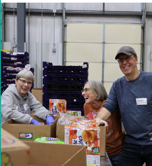
Ozarks Food Harvest can stretch your donation to feed more neighbors in need.