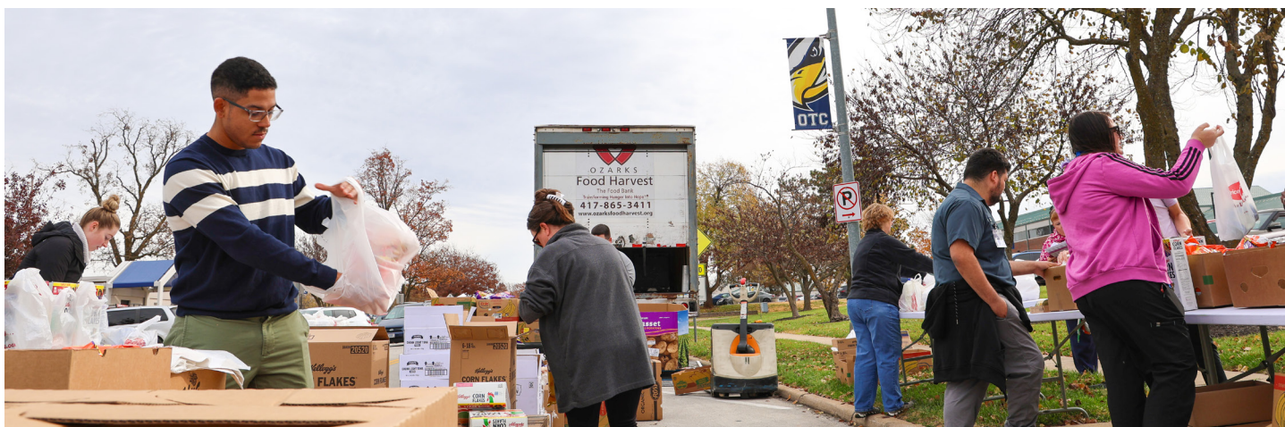
Ozarks Food Harvest's Mobile Food Pantry served nearly 300 students and staff at OTC.

Thanks to donors like you, Ozarks Food Harvest will utilize Mobile Food Pantry distributions at OTC through the end of the year. Thank you for helping us Transform Hunger into Hope .