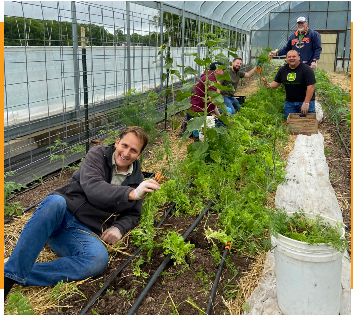
John Deere Reman staff have volunteered more than 450 hours.